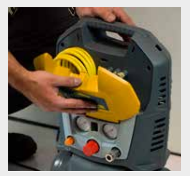
Smart flap for your tools storage. Be always