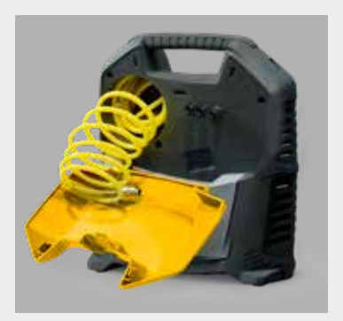
Spiral hose with universal tools mount.