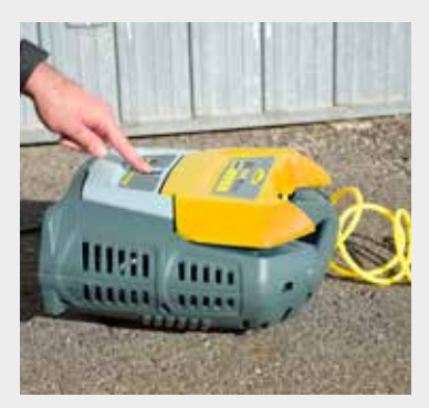
Designed to work efficiently both in vertical and horizontal position