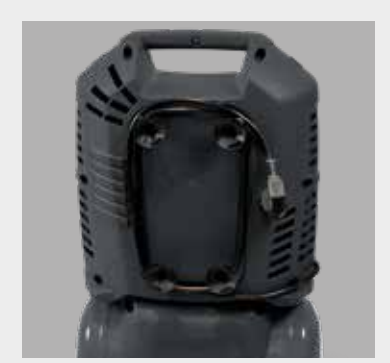
Extra shock absorber feet for horizontal use.

Ease of use and compactness are the most notable attributes behind new SCHNEIDER PackMaster air compressor.