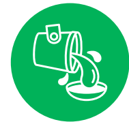
Metal and glass treatment